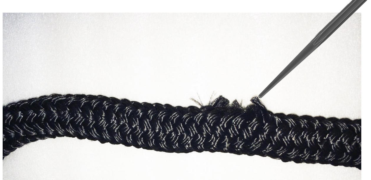
Figure 4: Repairing Damaged Rope Strands - 02

2-3 Loose rope strands can also be repaired by pushing them inside the rope with a tapered alignment punch. (Figure 4)