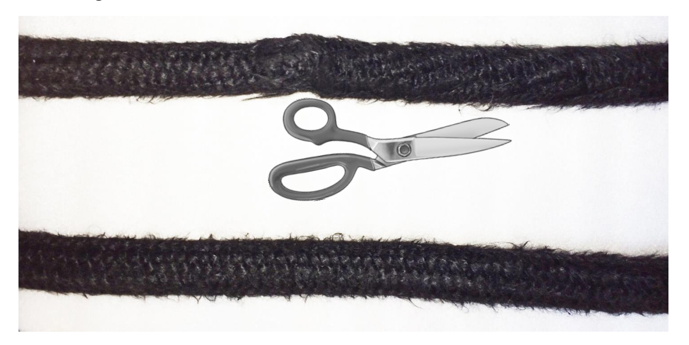
Figure 5: Example of a 3 Month Old Rope

3-1 Figure 5 shows an example of a several month old rope that has shrunk in length with a slight increase in outside diameter. Long strands of fiber can be trimmed using scissors.