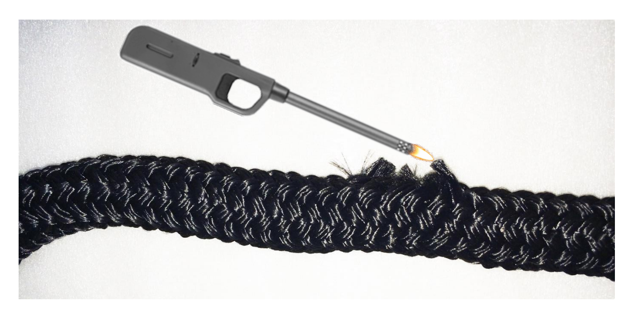
Figure 3: Repairing Damaged Rope Strands - 01

2-3 Loose rope strands can also be repaired by pushing them inside the rope with a tapered alignment punch. (Figure 4)