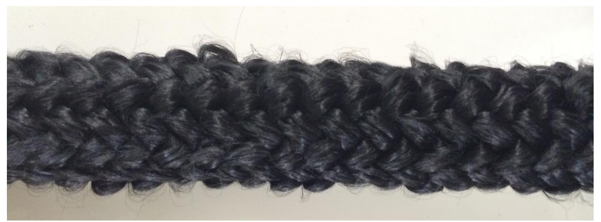
Figure 1: Polyester Black Rope with some signs of frayed fibers and strands